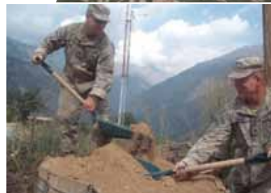
U.S. SOLDIERS WORKING IN AFGHANISTAN.