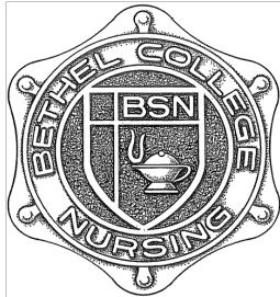
Bethel College BSN Nursing Pin