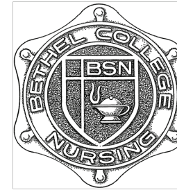
Bethel College BSN Nursing Pin